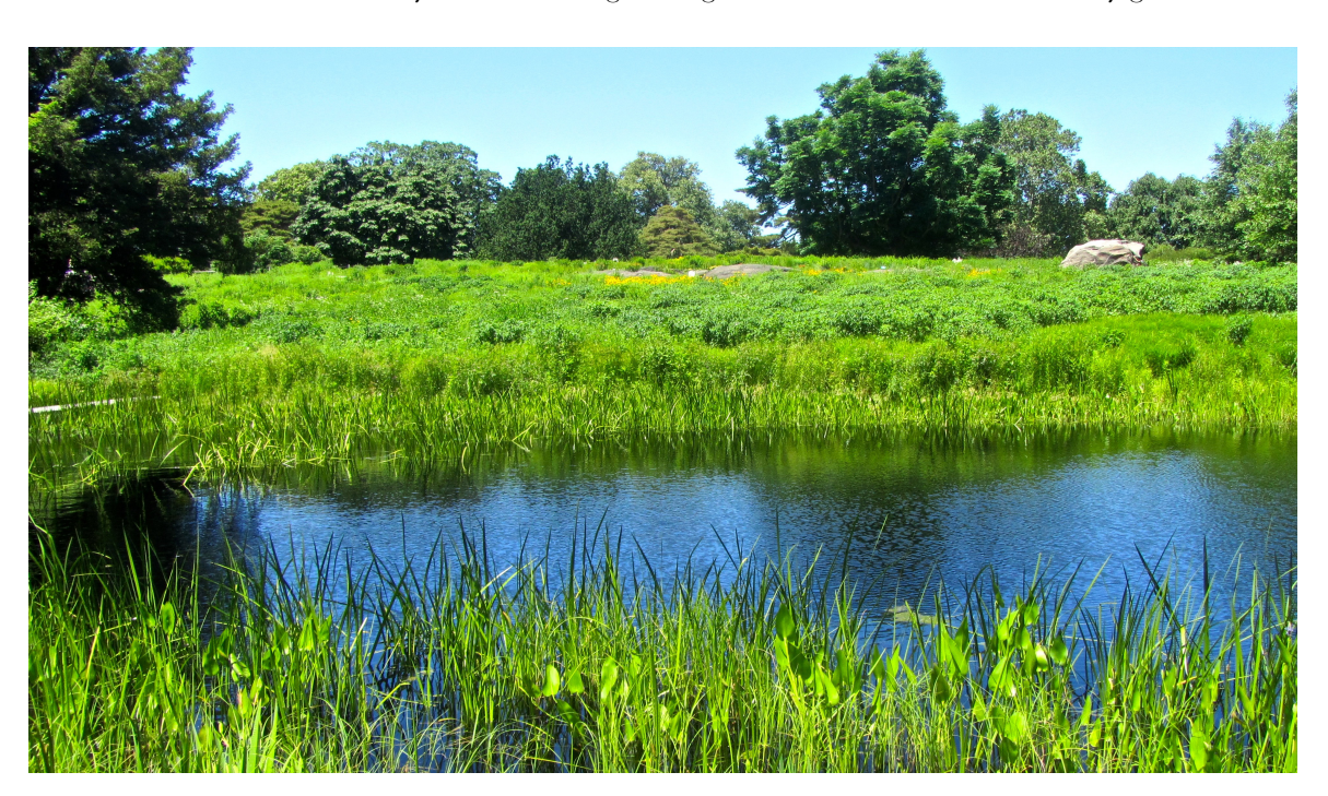
At right: Saturday morning

I remember our going to the back door of a house to ask for water. I was so full of myself and our expedition that I expected our appearance at their door to startle them. I thought it would be an unusual occurrence in their dull lives, something they'd turn into an anecdote to tell their neighbors when they got together at one of the dinners they gave one